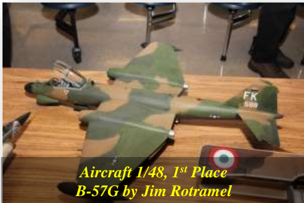
Aircraft 1/48, 1 st Place B-57G by Jim Rotramel