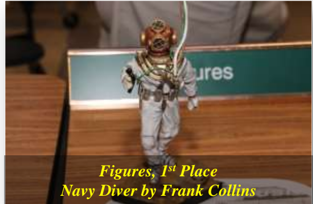
Figures, 1 st Place Navy Diver by Frank Collins