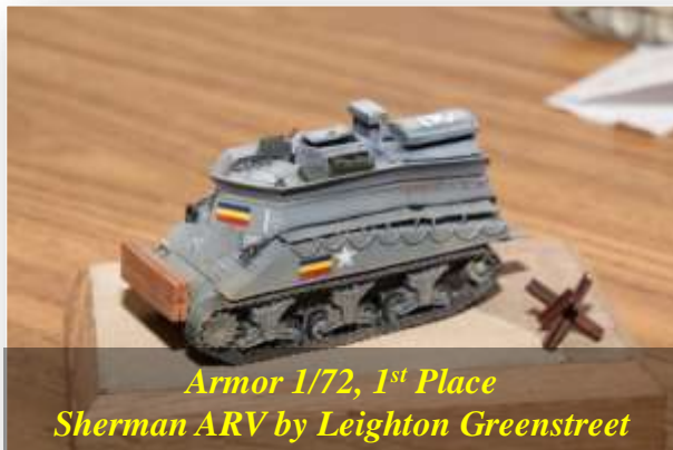
Armor 1/72, 1 st Place Sherman ARV by Leighton Greenstreet