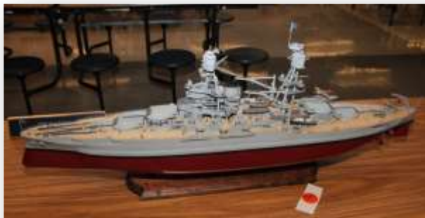
Ships, 1 st Place USS Arizona by Neil Shifflett