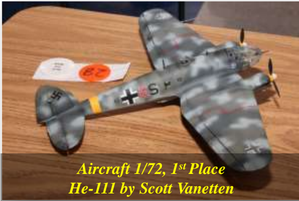
Aircraft 1/72, 1 st Place He-111 by Scott Vanetten