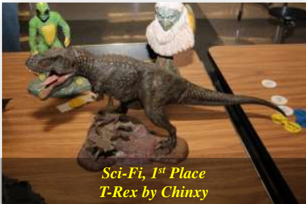
Sci-Fi, 1 st Place T-Rex by Chinxy