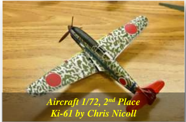
Aircraft 1/72, 2 nd Place Ki-61 by Chris Nicoll