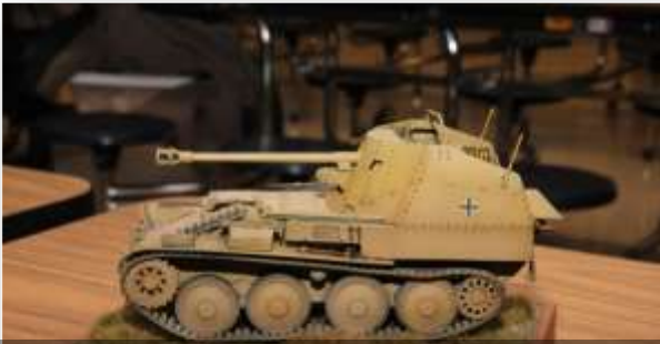
Armor 1/35, 1 st Place Marder III by Leighton Greenstreet