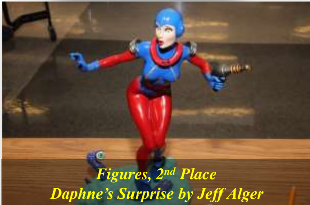
Figures, 2 nd Place Daphne's Surprise by Jeff Alger